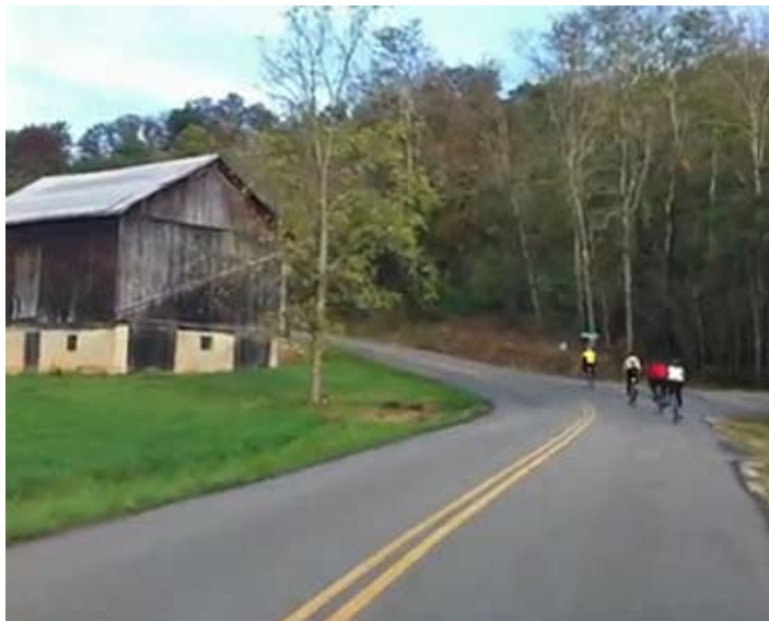
CFC 2010

They whine because the day starts so early, and they act more like a fool. Then out on the road, they're happy with bike paths, but give them a hill and just watch them drool. As they pass the special school