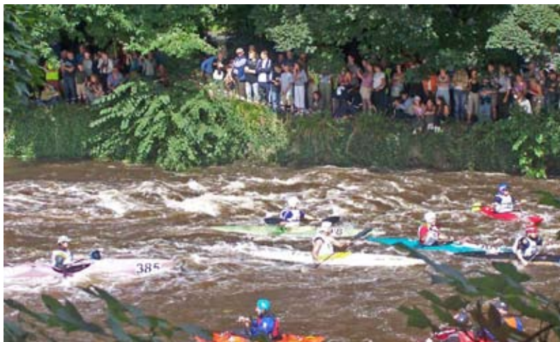
Below -After Straffan weir.