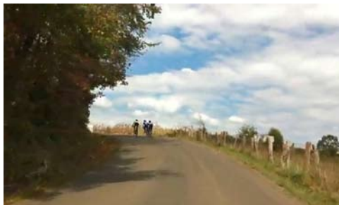
CFC 2010

After Straffan comes The Jungle. It will take almost 45 minutes to meander