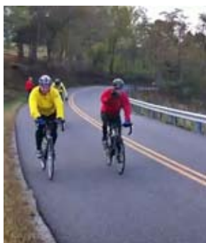
CFC 2010