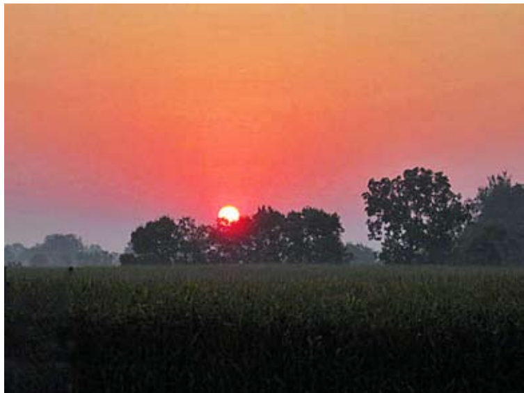
Sunrise over the cornfields.