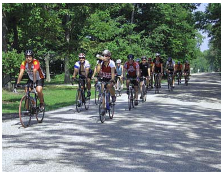
Riders headed to the Millersport Corn Festival, September 2011.